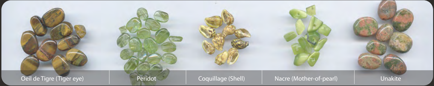
Oeil de Tigre (Tiger eye)